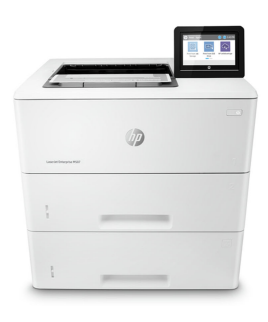
HP LaserJet Enterprise M507x