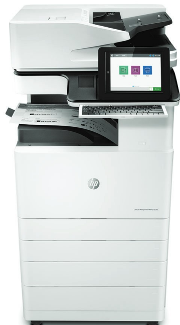
HP LaserJet Managed Flow MFP E72530z