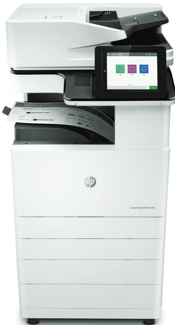
HP LaserJet Managed MFP E72530dn

Businesses that stay ahead don't slow down. It's why HP built the next generation of HP LaserJet MFPs—to power productivity with a streamlined design that delivers premium quality, maximum uptime, and the strongest security. 1