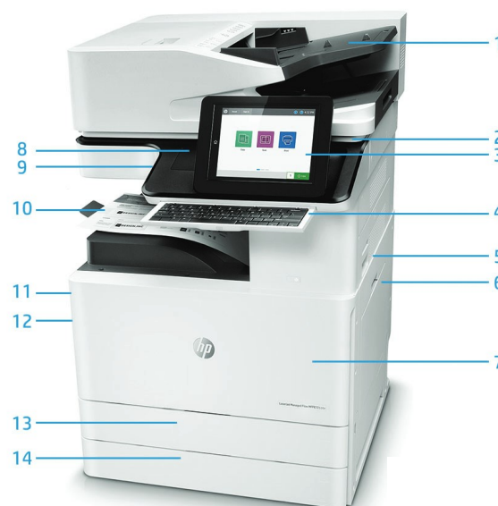
HP LaserJet Managed Flow MFP E72530z